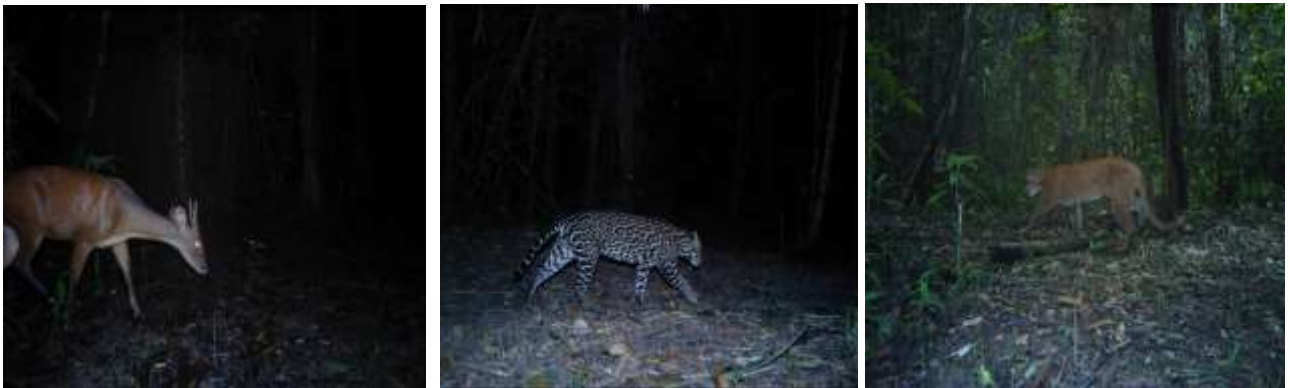
Samples of Downloaded data from camera traps