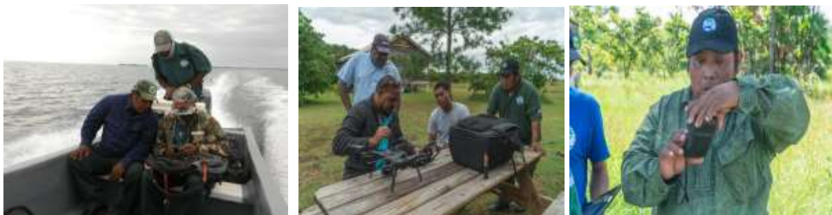
TIDE rangers in joint training to adopt SMART technology in the Maya Mountain Marine Corridor.