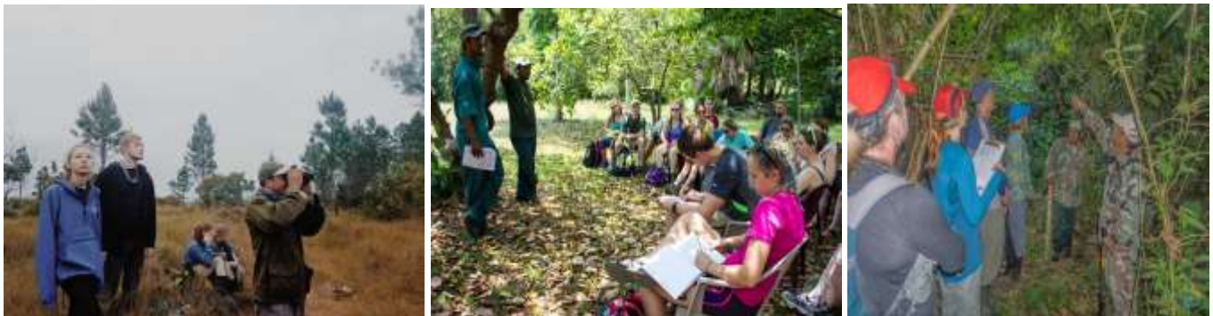
TIDE Ranger providing education and work experience on conservation activities to international volunteers