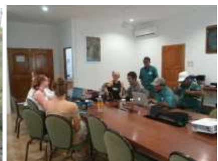
Camera Trapping Training - TIDE rangers trained in simple and cost-effective, field-based biodiversity monitoring system.