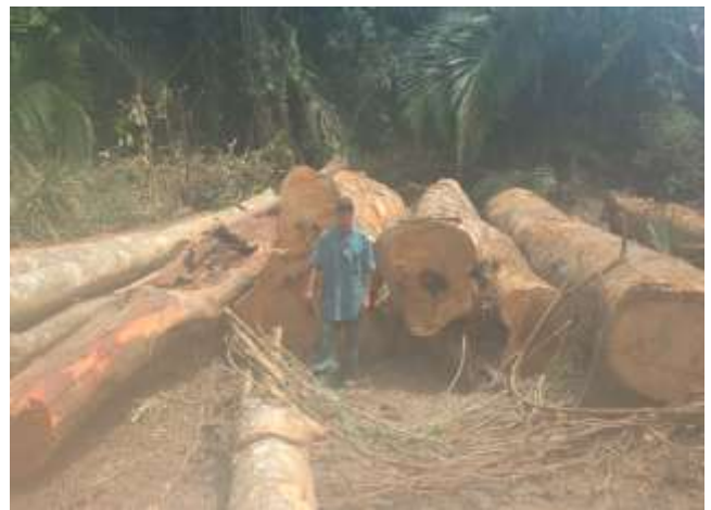
Land Base Patrols conducted by TIDE rangers to monitoring logging concessions buffering TIDE Private Protected Lands